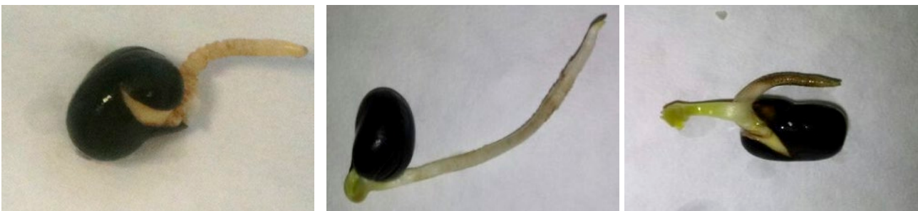
Figure 2. In vivo tests on Vicia faba roots treated with essential oil. Meristems showed a callose production after the treatment as an early symptom caused by lipid peroxidation.